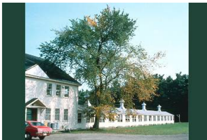
Flagging branches on infected tree