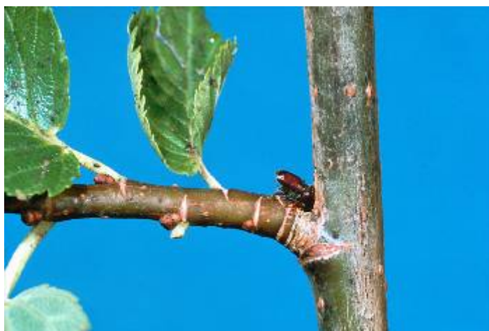
European elm bark beetle feeding at twig crotch

The first symptoms usually noted on infected trees are branches with leaves that turn yellow, wilt, and turn brown (flag). The typical pattern is for one branch to show the above symptoms, followed by adjacent branches and then a major portion if not the entire tree collapses and dies.